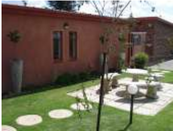
(Relaxation Area – For Tea Breaks)