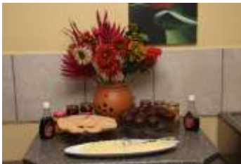
(Muffins and Cheese)