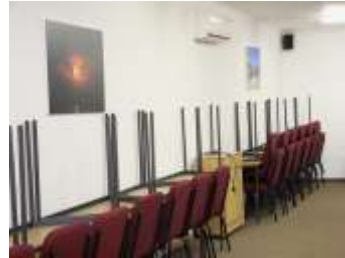
(Coffee and Tea Facilities)