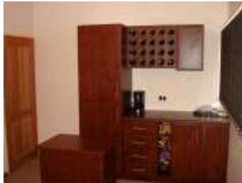
("Snacks" Cabinet – Complimentary)