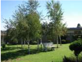
(Well Kept Garden)