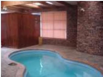
(Swimming Pool & Sauna)