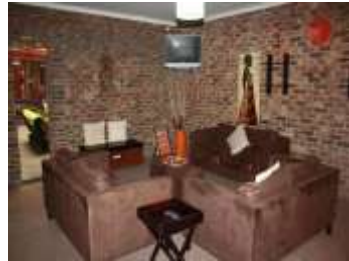
(Coffee Bar – Kambalala)