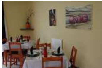
(Dining Area – 40 pax)