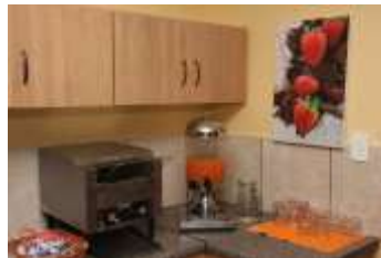
(Toaster and Juice)